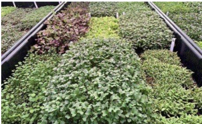
Figure 1. Various microgreens. (Stephens, n.d.)

Microgreens have a quick turnaround time, but growth rate differs among different types and varieties. Most vegetable varieties grown as microgreens are ready for harvest in about two weeks, although the brassica mustard and radish grow more rapidly and therefore mature before beets, carrots, and chard. Herbs tend to be slow growing, maturing in 16–25 days. Depending on microgreen type and variety, as well as environmental conditions, a production cycle can be as long as four weeks or slightly more (Johnny's Selected Seeds, n.d.).