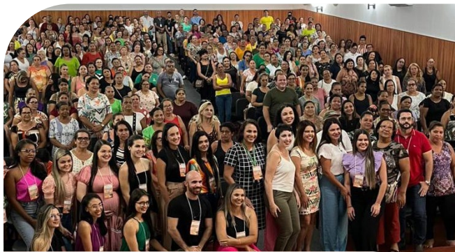
Hundreds of school directors, staff, and cooks from public schools in the Brazilian city Caruaru join us for a lecture to kick off the launch of their plant-based meal program.