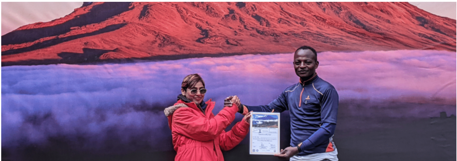
Andhra Pradesh Native Becomes First Vegan Indian Woman to Summit Mount Kilimanjaro

Actor John Abraham's fans met with him and shared a picture along with our ad campaign poster which garnered massive interaction on social media.